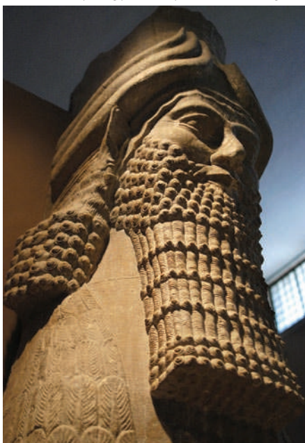
Early Mesopotamian culture had little overlap with that of ancient Egypt, despite their proximity.